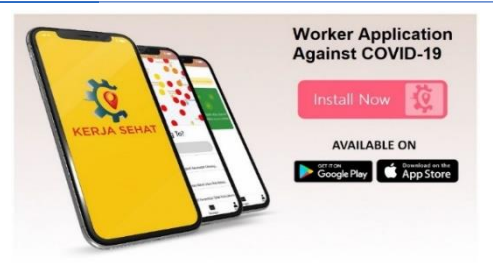
"Monitor the health of your employees before work"